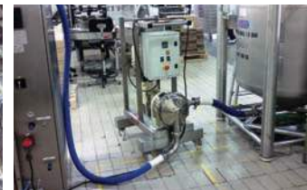
S4C FOR TRANSFERRING