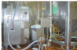
S4C WITH FLEXIBLE HOSE