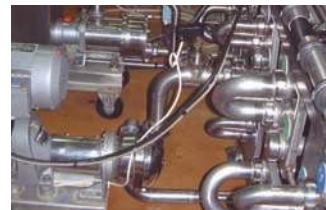
S4C FOR CONDITIONING