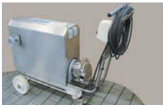
S4C ON MOBILE UNIT