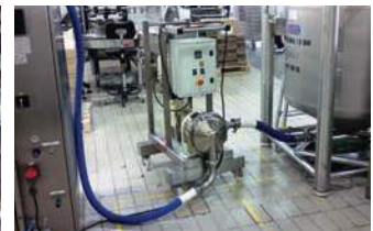
S4C FOR TRANSFERRING